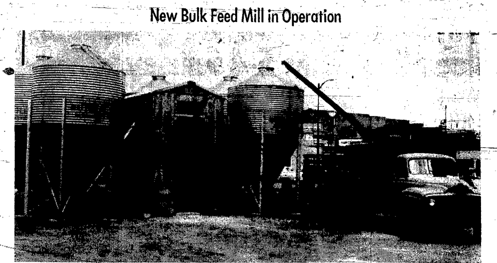
New Bulk Feed Mill in Operation The truck, pictured at right, is specially designed to deliver bulk feed to the farm from the mill. The mill is located on the lot east of Sherry Brothers' building on West First street.